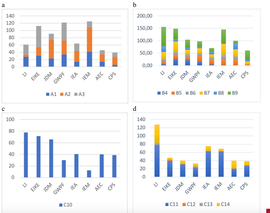
Fig. 2 Counter-frames appearance (% of articles per think tank). a. General scientific counter-frames. b. Specific scientific counter-frames. c. Criticism of advocates on a non-scientific basis. d. Ideological denial

Finally, the main focus of the text found was the scientific approach, with 43.14% of texts including this focus as primary stance, while ethics is the least encountered approach (see Fig. 3). Also, the publication of texts gathered in the think tanks’ websites, excluding the CPS case (for which posts were undated), showed that the bulk of texts were published recently, from 2014 to 2018. For instance, for the most radical claim found (B4: climate change is not happening) that the 63.79% of texts using this counter-frame were published between 2015